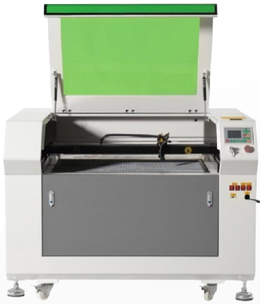
Sk 21 (2ft X 1ft)

Laser Engraving & Cutting Machine with Glass Laser Tube