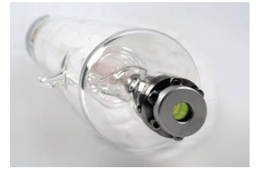
RECI Brand Laser Tube