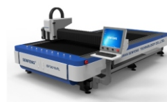
Fiber Laser Cutting Machine