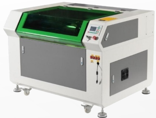
Sk 32 (3ft X 2ft)