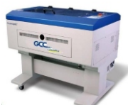
GCC Laser Machine (Mercury)