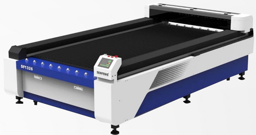
Sk 48 (4ft X 8ft)