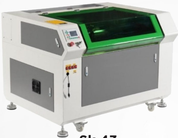
Sk 43 (4ft X 3ft)